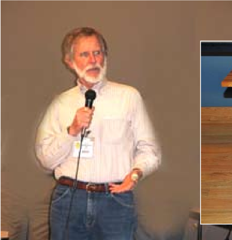
Table by Jim Gilreath