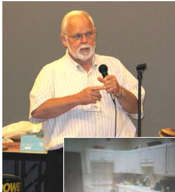
Kitchen renovation by Chuck Graham