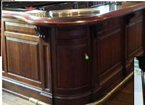
Poinsett Club Bar