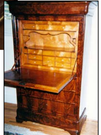
English Desk c.1850