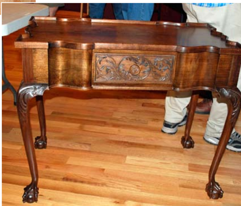
Goddard Style Table by Bobby Hartness