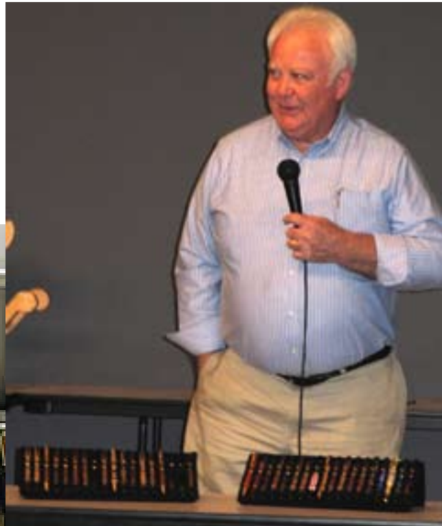
Pens by Roy Painter