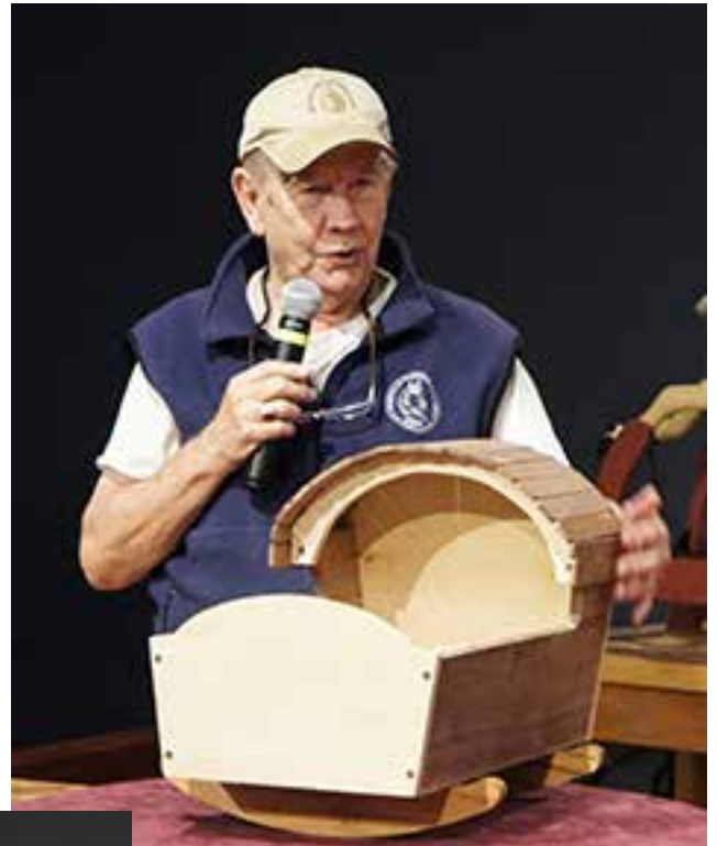
Cradle by Charlie Kindig