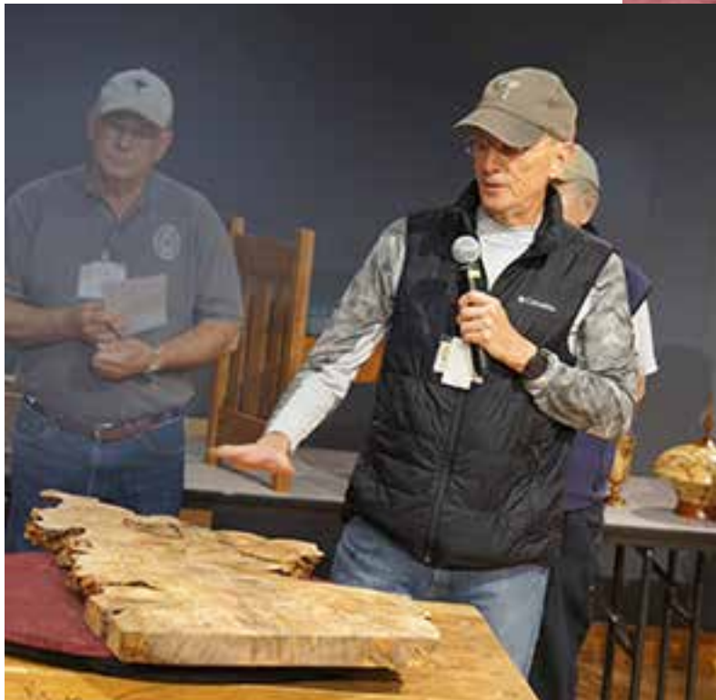
Burled Slab by Chuck Pressley