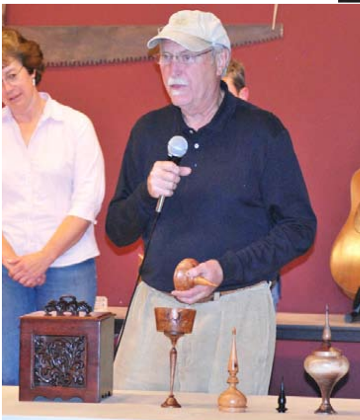
Carved box and Turnings by Jim Sinclair