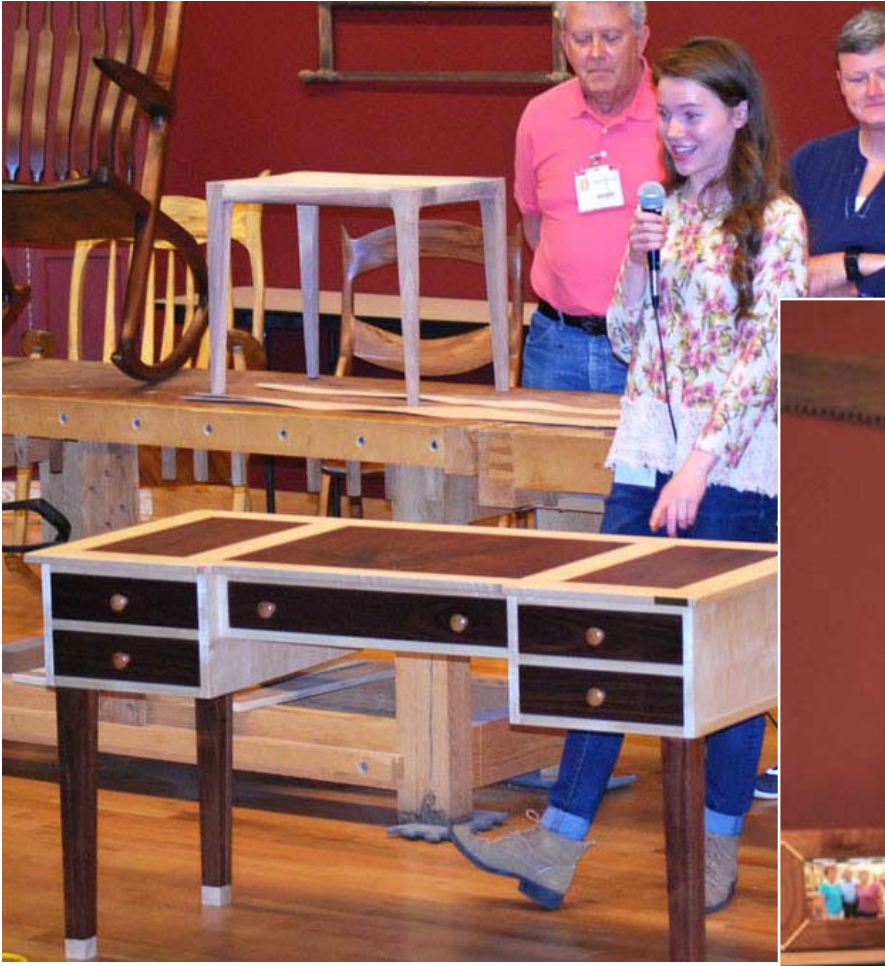
Desk by Student